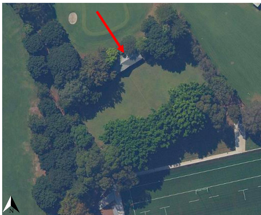
Figure 7: Aerial photograph over the clubhouse and lawns with club house indicated with arrow