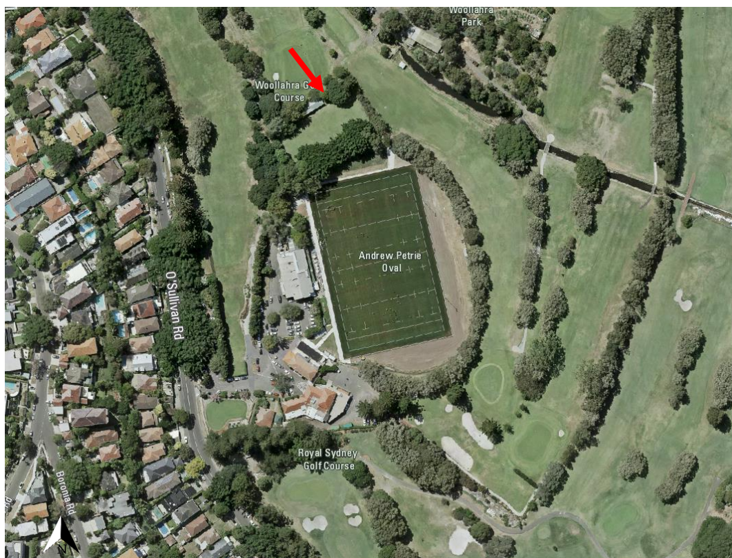
Figure 6: Location of the Croquet Club within Woollahra Park with Croquet Club indicated with arrow (Woollahra Council GIS)