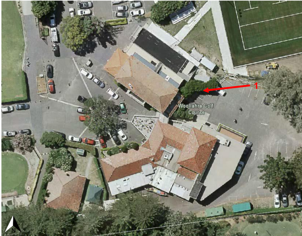
Figure 4: Aerial photograph over the site. Key: (1) George S. Grimley Pavilion.