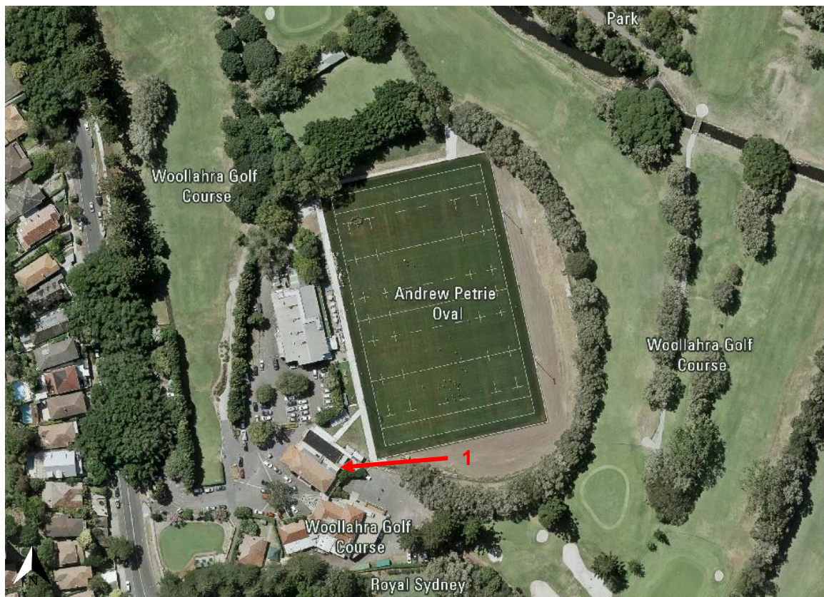
Figure 3: Location of building within Woollahra Park. Key: (1) George S. Grimley Pavilion (Woollahra Council GIS)