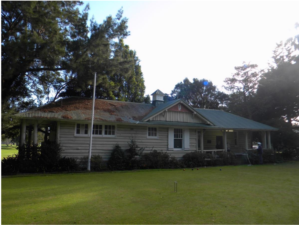
Figure 5: Sydney Croquet Club, southern elevation (WP Heritage and Planning)