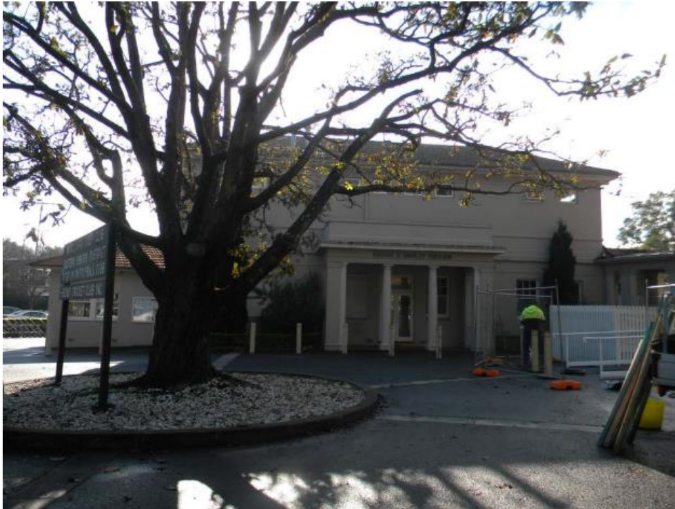
Figure 2: George S. Grimley Pavilion, south-western elevation (WP Heritage and Planning)