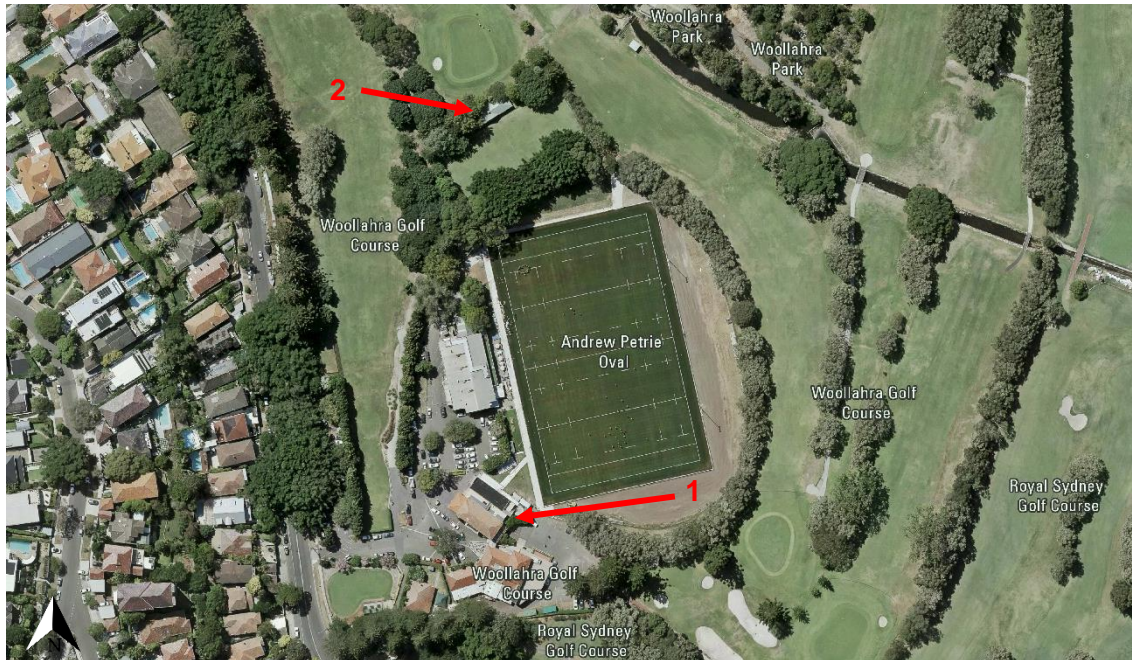
Figure 1: Location of the sites within Woollahra Park. Key: (1) George S. Grimley Pavilion, (2) Sydney Croquet Club (Woollahra Council GIS)

The George S. Grimley Pavilion and Sydney Croquet Club are both located within Woollahra Park, off O'Sullivan Road, Rose Bay. Figure 1 below is an overall site map showing the location of the two items in context.