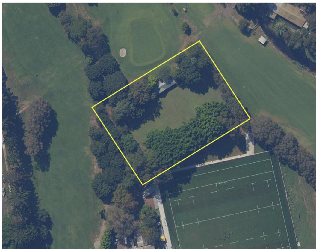
Figure 68: Recommended curtilage for listing on the Woollahra LEP 2014.

SIX Maps; annotation by WP Heritage and Planning.