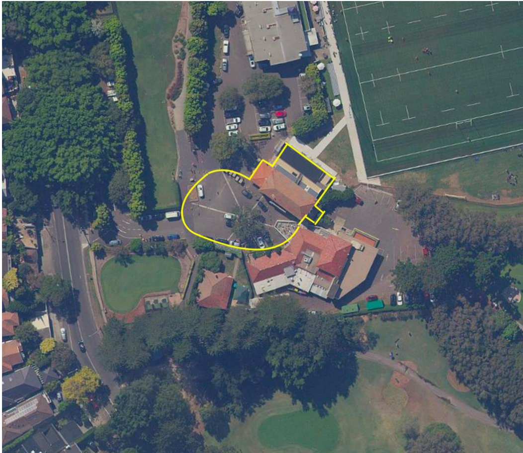
Figure 91: Reduced lot curtilage. SIX Maps; WP Heritage and Planning.

The following management policies are recommended: